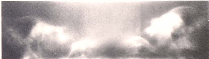
Fig. 3.—Case 3. Anteroposterior tomogram through posterior part of petrous bones. Small defect extends above floor of right internal auditory canal. Margins of defect are again regular and sclerotic.

be obtained by jugular venography. In all of our patients there was a lucent, diverticulumlike defect in the postero-medial part of the petrous bone. The base of the defect was in direct contact with the superior border of the jugular foramen without an intervening bony plate.