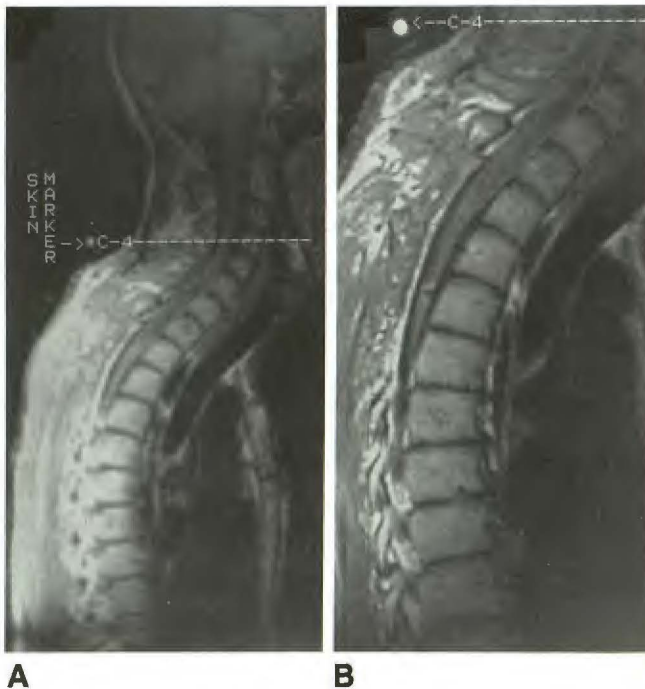
Fig. 1.—A, On sagittal localizer, surface marker (cod liver oil capsule) is at C4 level.

B, Sagittal T1-weighted image of thoracic spine shows surface marker clearly. It can be localized to level of C4 from image in A. Subsequently, any thoracic upper or mid-vertebral body can be accurately identified by using this reference point.