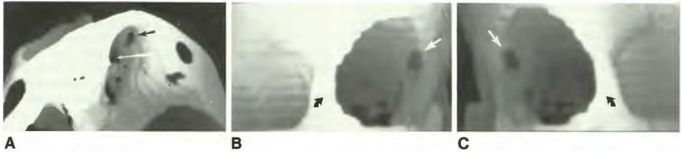
Fig. 2. — A , Three-dimensional CT reconstruction of anterior cranial fossa. Perspective is that of looking from above left orbital roof toward right orbit. There is a low-lying cribriform plate ( white arrow ) as well as osseous defect ( black arrow ) in anteromedial wall of right orbit through which meningoencephalocele passes from cribriform region into right orbit. A symmetric osseous defect of left orbit is not seen on this view.

B , Three-dimensional CT reconstruction of right orbit. Perspective is that of looking toward medial wall of right orbit from in front. Black arrow denotes frontal process of zygomatic bone. White arrow points to osseous defect at juncture of ethmoid, frontal, maxillary, and lacrimal bones through which meningoencephalocele from low-lying midline brain passes into orbit.