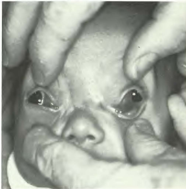
Fig. 1.—Preoperative photograph of patient demonstrates apparent hypertelorism with bilateral medial intraorbital cystic masses. Note saddle-nose deformity.

pathologically confirmed as arachnoid. The frontal lobe was abnormal with several vertical sulci but normal gyri; the temporal lobe appeared normal. Cerebral tissue extended from the frontal lobe toward the cribriform plate, which was in an unusually low position. Bilateral olfactory nerves were seen. The falx was incompletely developed. Two tongues of cerebral tissue exited the skull through small bilateral bone defects located superior and lateral to the low-lying cribriform plate. The encephalocele stalk was amputated and evacuated from the medial orbit. Attempts to remove the meningeal capsule from the orbit were unsuccessful because it adhered to the periorbita. The