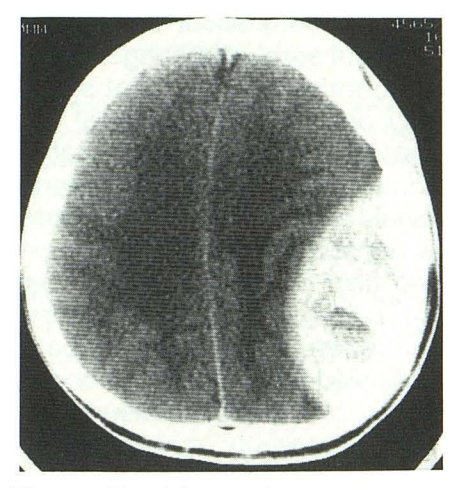
Fig. 2. CT scan of head: Large left posterior parietal EDH that required urgent evacuation. Note central lucencies in the posterior portion suggesting active bleeding.

cases of acute EDH could be safely followed to complete recovery. In Knuckey's series (17), seven of 22 patients (32%) were taken to surgery 1 to 10 days following the acute event, but only two of Pang's (15) 11 patients and none of the cases in Pozzati's (9), Servadei's (16) or Bullock's (3) series (22, 42, and 12 patients, respectively) went on to surgery. Our series also shows minimal "crossover," with only one of the 18 patients assigned initially to nonoperative management requiring subsequent surgery.