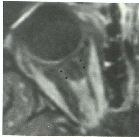
Fig. 3. T1-weighted (600/20/2) post-gadolinium 3-mm axial scan (obtained with fat suppression) demonstrates meningioma of the posterior two thirds of the right optic nerve sheath. Anterior to the meningioma there is dilation of the optic nerve sheath (arrows). In the central portion of the dilated nerve sheath is an atrophic optic nerve.