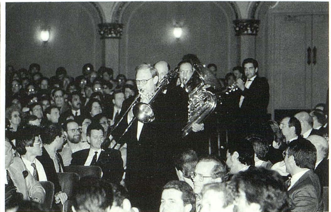
Canadian Brass performance at the restored Orpheum Theatre.