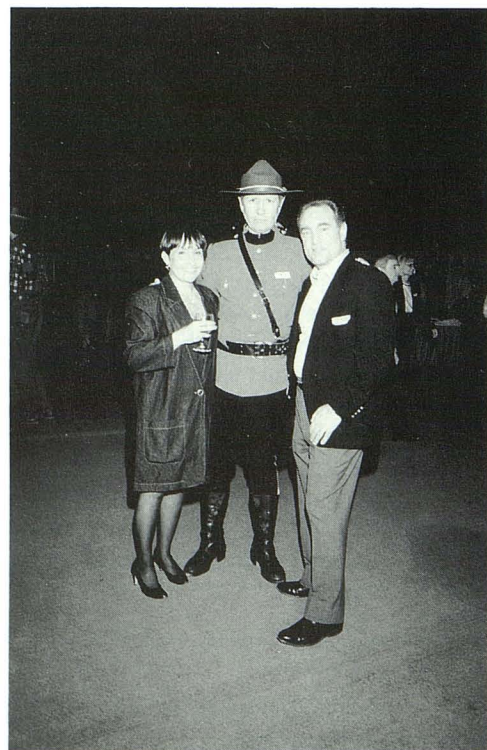
Security at the meeting was top-notch.