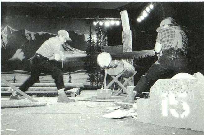
A demonstration of Native British Columbia customs at the opening reception.