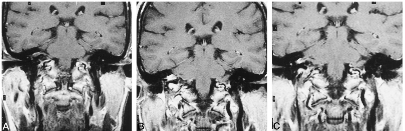
FIG 2. Contrast-enhanced coronal T1-weighted MR images after resection of an acoustic neuroma show changes in enhancement at the postoperative site.