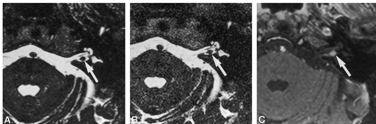
FIG 2. The visibility of a small intracanalicular (2-mm diameter) tumor (arrow) was also comparable with both imaging sequences (27 ETL, A; 148 ETL, B). Corresponding enhanced 3-D spoiled gradient-echo sequence (C) shows tumor originating from inferior vestibular nerve (arrow).