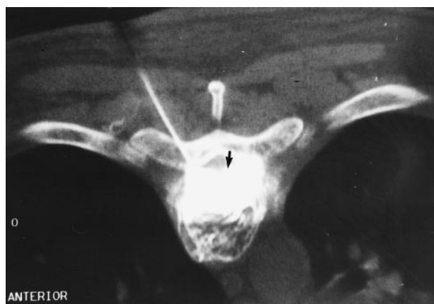
FIG 1. Axial CT scan at the level of the maximal epidural soft-tissue component of the hemangioma taken during injection of contrast medium through the needle positioned into the vertebral body. Note the excellent opacification of the epidural soft tissue on either side of midline (arrow).

ages were taken in the sagittal and axial planes through the region of interest. A whole-spine study also was conducted to look for additional lesions. Diagnosis was based on typical signal characteristics of the lesions on MR images (hyperintensity on both T1- and T2-weighted MR images) in thirteen patients. One patient with atypical characteristics on MR images had undergone CT-guided biopsy of the vertebral lesion for establishing the diagnosis. Indication for intervention was progressive paraparesis in thirteen patients, and severe debilitating pain in one. All patients had extraosseous extension of the hemangioma.