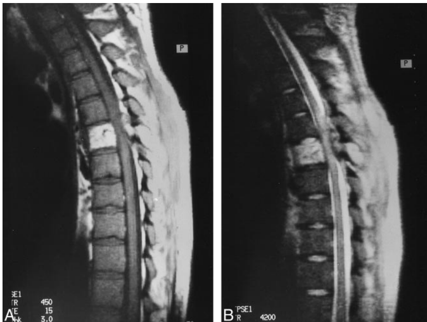
FIG 3. A 35-year old man who presented with paraparesis. T1- (A) (450/15/3, [TR/TE/excitations]) and T2-weighted (B) (4200/90/1) sagittal MR images show a typical hemangioma at midthoracic level. The posterior elements also are involved, and the spinal canal is compromised. Note the presence of hyperintense signal within the spinal cord on the T2-weighted image.

All patients showed transient neurologic deterioration, in the form of worsening paraparesis, lasting up to 5 days after the procedure. The patients were continued on oral steroids during this time. Subsequently, five patients showed excellent improvement, with near-complete alleviation of symptoms, whereas seven showed significant improvement. The improvement continued for up to 14 months after the procedure. One patient showed significant clinical improvement in the initial 3 weeks, but then deteriorated rapidly. This patient had shown unusual features on MR images, and the