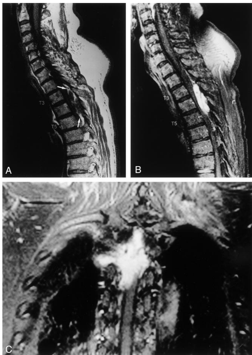
FIG 1. Signal intensity of mass was inhomogeneous in hypointensity on T1-weighted images and strongly enhanced with IV injection of contrast medium on fat-saturated T1-weighted images. On fat-saturated T2-weighted images, tumor showed high signal intensity with internal linear hypointense foci.

A, Unenhanced sagittal view T1-weighted MR image (517/21/2) shows extradural mass located in posterior epidural space at level of T3 extending to T5 (arrows). Mass displays inhomogeneous predominately low signal intensity mixed with intermediate signal intensity content.