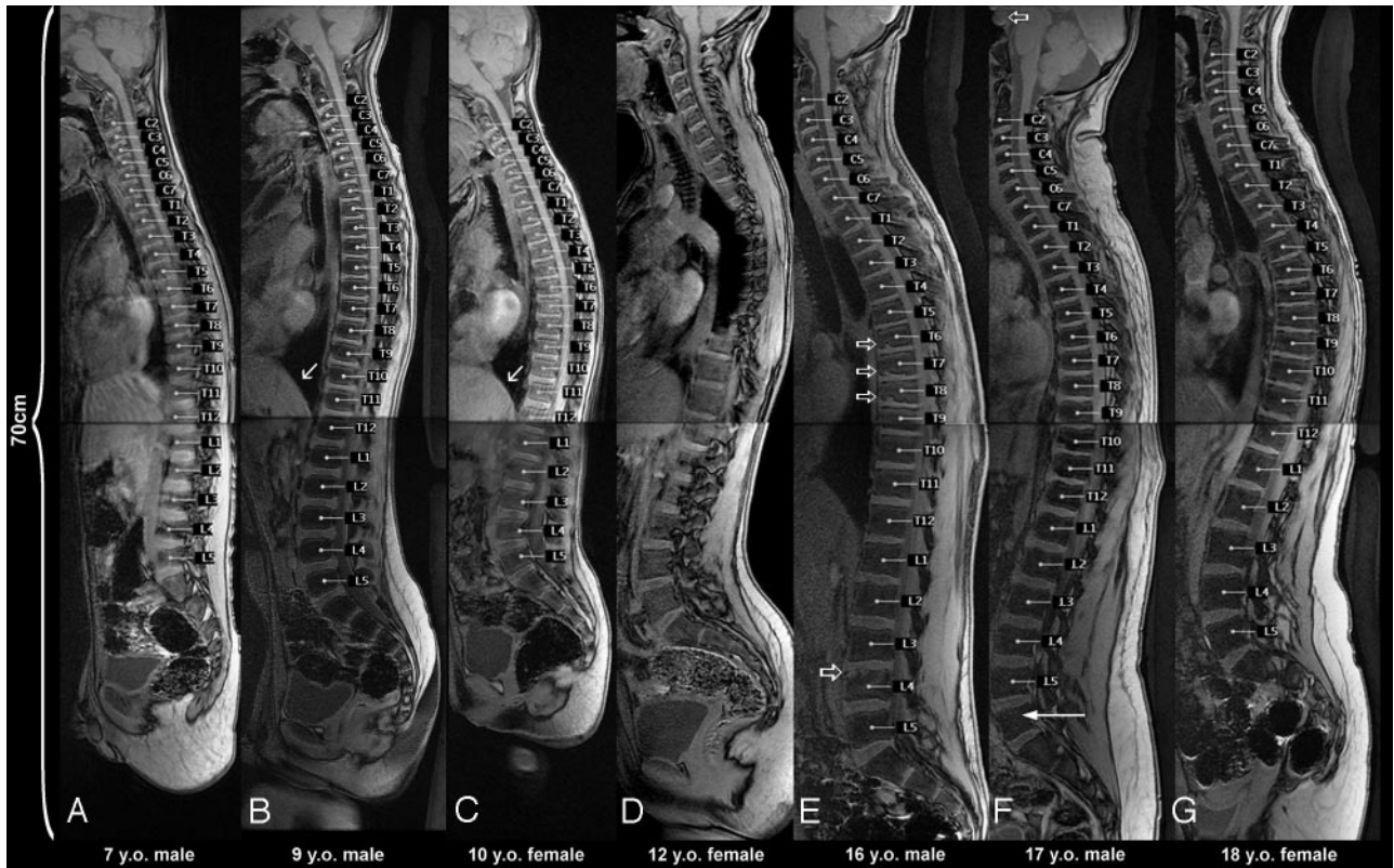
Fig 1. Midline sagittal ASSIST (from left to right). A , A 7-year-old boy with ADHD demonstrating mild motion artifacts. B , A 9-year-old boy with Asperger syndrome. Diaphragmatic contour (arrow) is well defined, suggesting good breath-hold. C , A 10-year-old girl with developmental delay and short stature. Diaphragmatic contour (arrow) is well defined, suggesting good breath-hold. D , A 12-year-old girl with prominent scoliosis. Examination resulted in autolabeling failure. E , A 16-year-old adolescent boy with mild Scheuermann disease at T6-T8 (arrows) and L4 superior endplate deformity (arrow). F , A 17-year-old adolescent boy with lumbarized S1 (L6) vertebrae (closed arrow) and enlarged pituitary gland (open arrow). G , An 18-year-old woman with mild kyphoscoliosis.