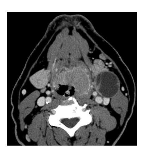
FIG 4. HPV-positive SCCOP demonstrating a cystic nodal metastasis. Axial contrast-enhanced CT image shows an obvious bulky midline left-sided base of tongue cancer (with characteristically well-defined borders) and a predominantly cystic mass in level IIa.

separate clinical entity, driven by different somatic molecular events and with a different clinical phenotype. 11,22