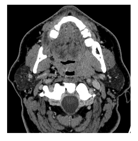
FIG 3. HPV-negative SCCOP demonstrating ill-defined borders. Axial contrast-enhanced CT image shows a mass in the left tonsil, with poorly defined borders, especially anteriorly.

pair analysis, cystic nodal metastases were associated with HPV-positive tumors (>5-fold; P=.013; On-line Table 2). Invasion of adjacent muscle was associated with HPV-negative tumors (P=.002; On-line Table 2).