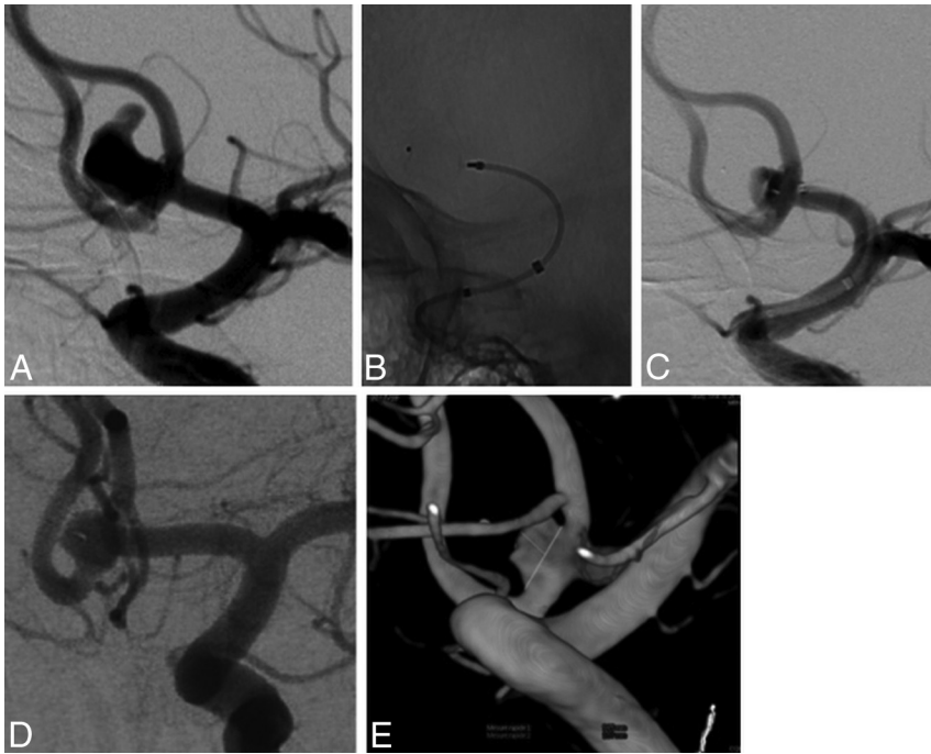
FIG 3. A 46-year-old man with an anterior communicating artery aneurysm. A , Angiography shows a 6-mm wide-neck 8-mm-long anterior communicating artery aneurysm. B and C , A 7 × 5 mm WEB-SL device is successfully deployed. D and E , Six-month follow-up angiography shows a significant neck remnant.

Case 3. A 46-year-old man (patient 10) presented with an incidental anterior communicating artery aneurysm. Angiography revealed a 5.4-mm wide-neck anterior communicating artery aneurysm (Fig 3 A ). Endovascular treatment was performed by using a WEB-SL device with final incomplete aneurysm occlusion (Fig 3 B , - C ). Angiographic follow-up at 6 months revealed incomplete occlusion of the neck (Fig 3 D , - E ).