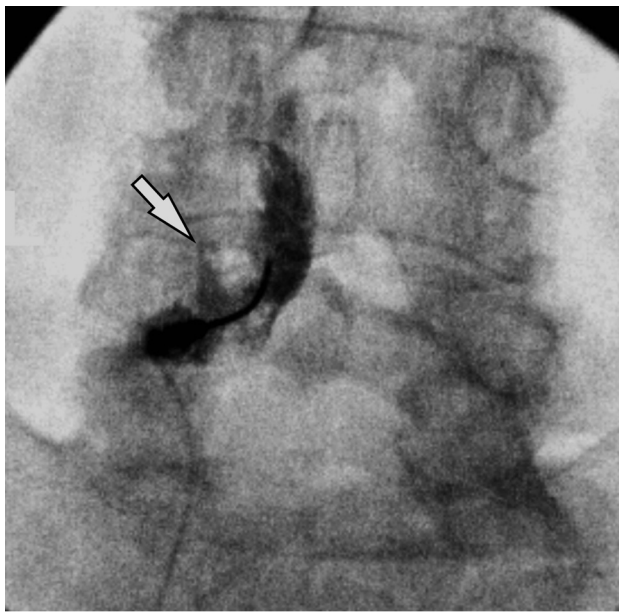
FIG 3. Inadvertent intrafacet injection in a 63-year-old man with a painful L4–5 central disc protrusion who underwent ILESI by using conventional fluoroscopic guidance. The final procedural image shows a triangular configuration of contrast overlying the inferior aspect of the left L4–5 facet joint, consistent with intrafacet injection.