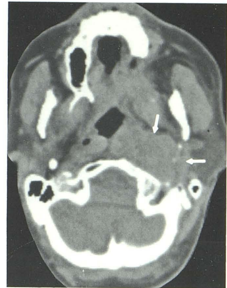
Fig. 2.—65-year-old man with left vocal cord paralysis. Physical examination was otherwise normal. Large, entirely submucosal squamous cell carcinoma in nasopharynx (arrows). Confirmed by CT-guided biopsy.