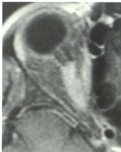
Fig. 1. T1-weighted 700/12/2 (TR/TE/excitations) post-gadolinium 3-mm thick axial scan obtained with fat suppression in a head coil. Note periopic enhancement of the mid portion of the optic nerve which reflects a meningioma. The anterior 6 mm of the nerve appears normal with two adjacent low intensity linear bands representing dilated perineural CSF-containing spaces (arrows).

A previously healthy 39-year-old man complained of blurred vision in the right eye. Visual acuity was 20/40, and an afferent pupillary defect and chronic optic disc edema in the right eye were noted. MR revealed a sheath type enhancement of the right optic nerve extending from 6 mm behind the globe, through the optic canal, to the intracranial lip of the optic canal. Cystic dilatation of the nerve sheath was seen between the distal edge of the tumor and the eyeball (Fig. 1). The findings were characteristic of