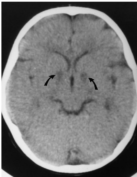
Fig 2. Case 2, 2-year-old boy. Noncontrast CT examination shows bilateral low-attenuation abnormalities in the globus pallidus (arrows).

before the age of 5 years (4). Type II disease is characterized by late infantile onset, short stature, coarse facies, mental retardation, hypertension, confluent skin lesions termed angiokeratoma corporis diffusum, and longer survival than type I. It is becoming clear, however, that a disease spectrum exists, with some cases having features of both subtypes (5). Two thirds of patients survive into the second decade (5), but survival past the age of 30 is rare (2). The mode of transmission is thought to be autosomal recessive (3). Clusters of the disease are seen within a few ethnic groups. A large percentage of the reported cases of fucosidosis are found in either southern Italy or the Mexican-Indian population of the western United States (5).