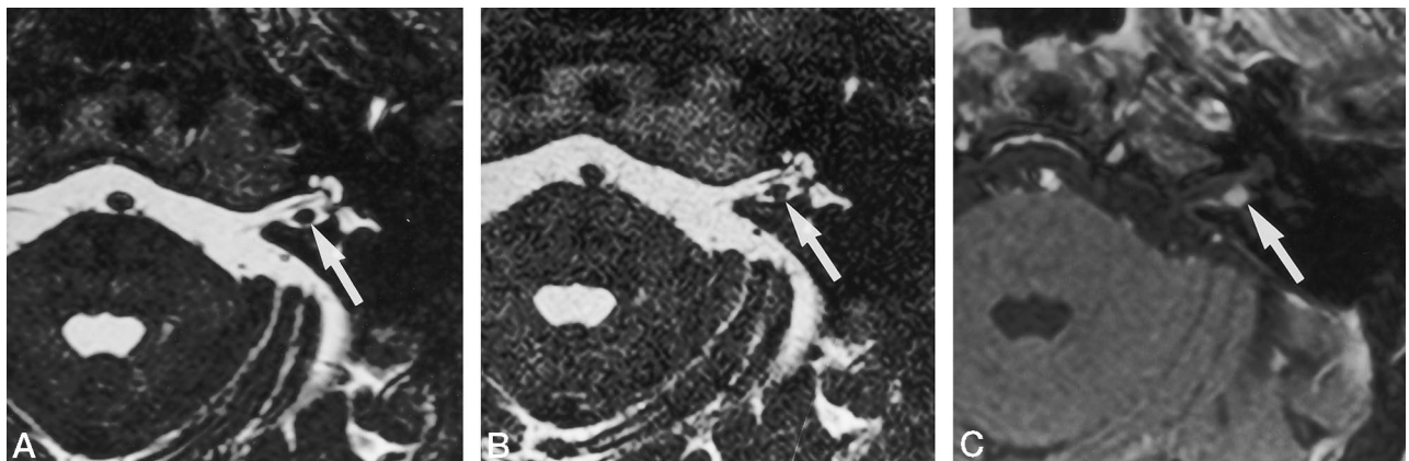
FIG 2. The visibility of a small intracanalicular (2-mm diameter) tumor (arrow) was also comparable with both imaging sequences (27 ETL, A; 148 ETL, B). Corresponding enhanced 3-D spoiled gradient-echo sequence (C) shows tumor originating from inferior vestibular nerve (arrow).