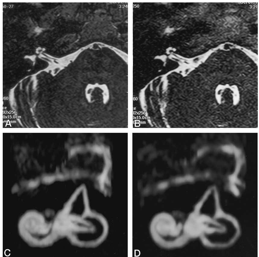
FIG 1. MR images obtained using a 27 ETL sequence (15-minute scan time) (A) and a 148 ETL sequence (less than 3-minute scan time) (B). In both images, the anatomy of the labyrinth and internal auditory canal can be well appreciated. The quality of the MIP images of the inner ear are almost comparable (27 ETL, C; 148 ETL, D).