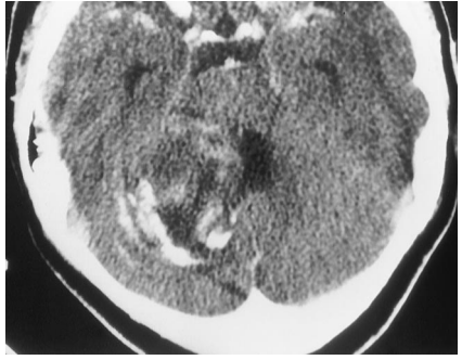
Fig 2. Post contrast axial CT shows a ganglioglioma in the right cerebellum. The tumor has mass effect on the fourth ventricle and is inhomogenous in density. The calcifications have a bizarre pattern and follow the folia. In appearance of this mass is non specific and this case, ganglioglioma was considered the