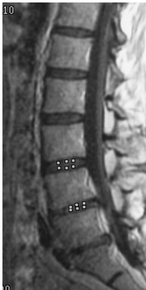
FIG 1. Sagittal MR image of the lumbar spine shows the position of cursors used to measure changes in signal intensity in the intervertebral disk. Six cursors are illustrated in the L4-L5 (normal) disk and the L5-S1 (degenerative) disks. For this study, the signal intensity changes in the central cursors were tabulated. Variance may be reduced by using multiple cursors; for example, all six of the cursors illustrated. A cursor near the center of the disk (not shown), farther from the endplate, detects a smaller change in signal intensity after intravenous administration of contrast medium.

In the 15 patients, 15 disks were excluded because of previous discectomy and 29 because of artifacts or advanced degeneration. Eighteen normal disks and 13 degenerative intervertebral disks were measured. Of the 13 degenerative disks, six with evidence of a