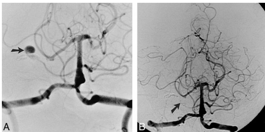
FIG 3. Case 2: angiograms show partially clipped aneurysm treated with short Guglielmi detachable coils.

B, Arterial phase of angiogram after treatment shows parent vessel occlusion by coils (arrow).