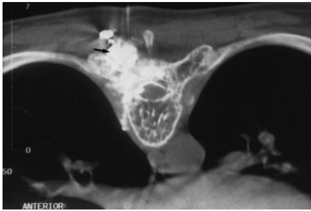
FIG 2. Axial CT scan obtained similarly in another patient shows extravasation of contrast into the paraspinal muscles (arrow) and pleural cavity. The procedure was abandoned at this stage.

Clinical improvement/deterioration was also correlated with the corresponding decrease/increase of an epidural soft-tissue hemangiomatous component on MR imaging. The follow-up MR examinations were evaluated with respect to the appearance/disappearance of cord changes, and changes in the imaging characteristics of the lesion itself. Loss of height of the vertebral body, when present, also was documented.