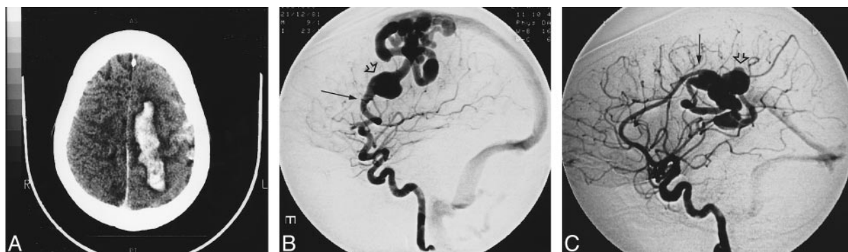
FIG 2. Images from the case of a 15-year-old woman who presented with right hemiplegia, a history of recurrent epistaxis, and a family history of HHT. She was also subsequently diagnosed with a pulmonary AVM.

A, Unenhanced CT scan shows an intracerebral hemorrhage and subarachnoid hemorrhage.