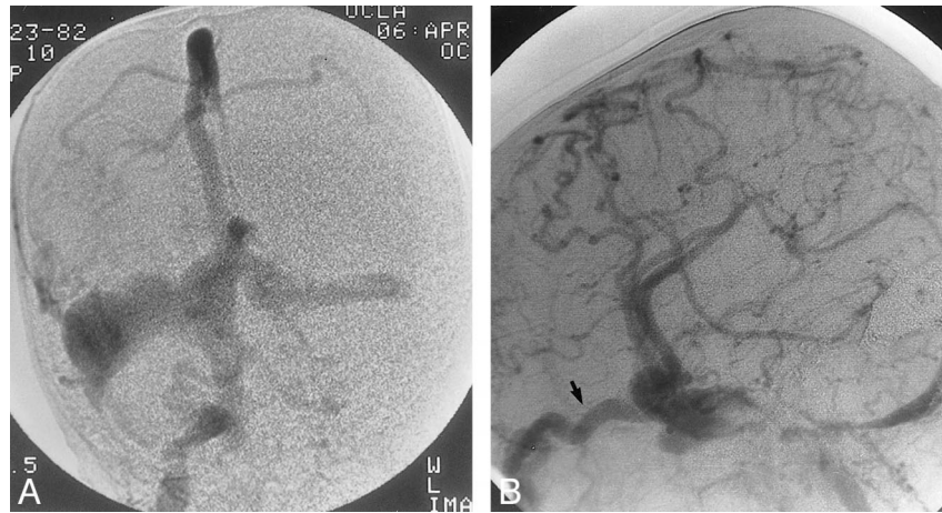
FIG 3. Patient 5, with a dural sinus malformation, was an 18-month-old who presented with seizures and prominent facial veins.

A, Anteroposterior view angiogram of the right external carotid artery, venous phase, shows bilateral sigmoid sinus occlusions and an enlarged occipital vein. The arterial phase (not shown) showed enlarged right occipital artery feeders to a large right transverse sinus dural fistula.