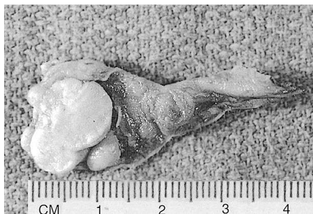
FIG 2. Specimen for macroscopic examination shows well-encapsulated soft-tissue mass with a smooth, tan external surface. Cut surfaces show a cystic mass with a mural firm pink-tan nodule that attached to the cyst wall by a narrow stalk. The cut surfaces of the nodule are pink-tan without evidence of hemorrhage or necrosis. The rest of the internal surface is yellow-tan and focally covered with yellow, greasy material.

D, Axial T1-weighted image shows the mass (arrow) within the spinal canal, with leftward displacement of the conus medullaris.