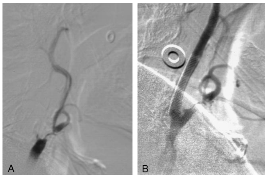
FIG 2. Case 2. A 72-year-old man had global aphasia and right hemiparesis.

A, Baseline left lateral CCA angiogram shows complete occlusion of the cervical ICA. Flow through a 50% stenosis of the external carotid artery remains visible.