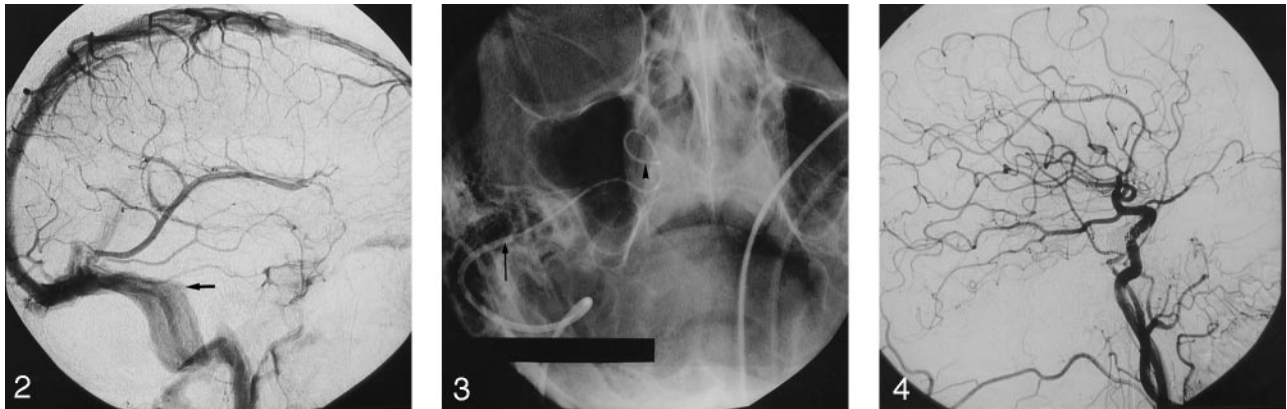
FIG 2. Venous-phase lateral left common carotid arteriogram. The most distal aspect of the right SPS is faintly opacified as it merges with the right transverse sinus ( arrow ).

FIG 3. Frontal skull radiographic image shows retrograde catheterization of the right SPS via a right internal jugular route. A 5F hydrophilic catheter ( arrow ) is positioned into the distal end of the right SPS by means of a right jugular approach. A microcatheter ( arrowhead ) is coaxially introduced into the 5F catheter and navigated into the SPS to reach the CS.