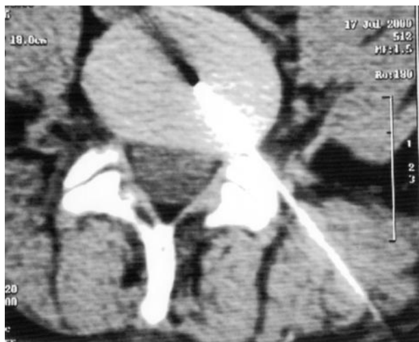
Fig 1. Puncture at L4-L5 performed under CT guidance.

patients with oxygen-ozone therapy and compared the outcome in patients receiving medical ozone alone with that in patients who also received a corticosteroid and anesthetic mixture injected at the same session.