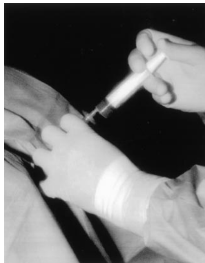
Fig 2. Injection of the oxygen-ozone mixture through a millipore filter.

Selection criteria for oxygen-ozone therapy were the following. Clinical criterion was low back pain resistant to conserva-