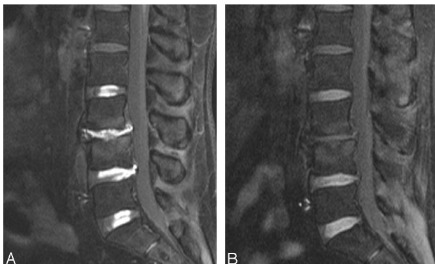
FIG 3. Images obtained in a 47-year-old man with back pain.

A, Sagittal T1-weighted, fat-saturated (TR 954, TE 15) from an initial postgadolinium diskogram again shows the excellent delineation of disk architecture with normal-appearing disk spaces at L2–L3 and L5–S1, whereas the L3–L4 level is severely narrowed, with no recognizable disk architecture remaining. Both the L3–L4 and L4–L5 levels have contrast filling subligamentous disk extrusions.