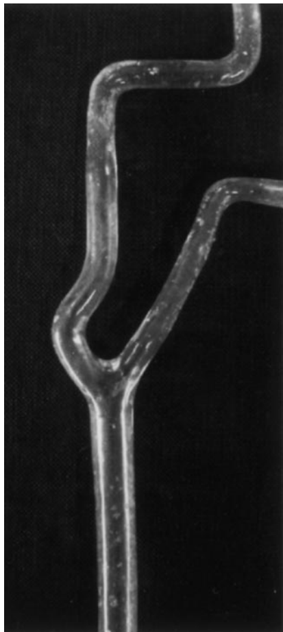
Fig 1. Simplified silicone model of the human carotid artery bifurcation with a nominal angulation between the CCA and initial ICA segment of 30° counterbalanced by a curve.