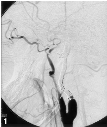
FIG 1. Angiogram obtained after embolization shows complete occlusion of the ICA with coils tightly packed in all affected portions of the right ICA.