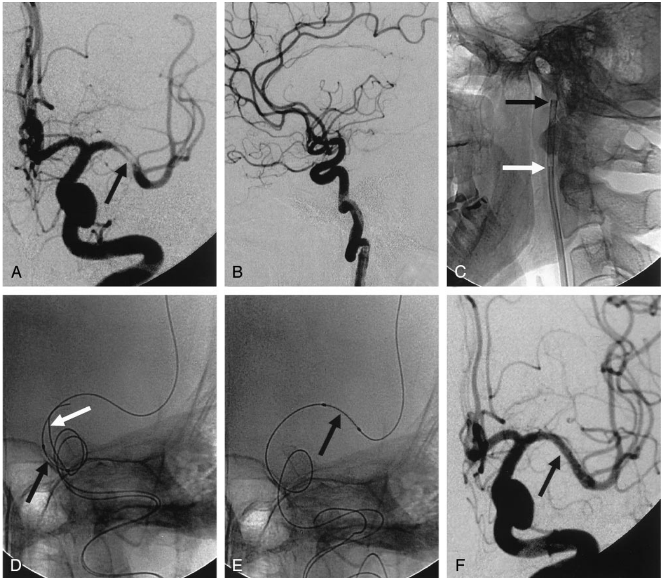
FIG 3. Coaxial double-guiding catheter technique.

A, Anteroposterior left ICA angiogram shows >80\% stenosis (arrow) of the M1 portion of the MCA.