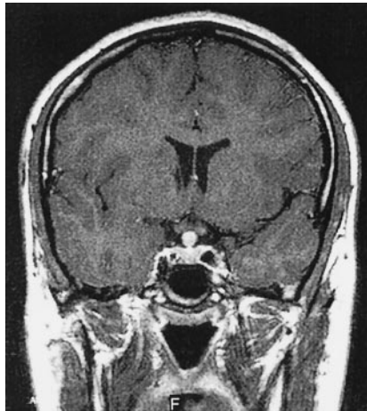
FIG 1. Coronal T1-weighted image following intravenous gadolinium, showing discrete enhancing infundibular mass at presentation.

Regression of pituitary region tumors following administration of steroids is well recognized in germ cell tumors, lympho-