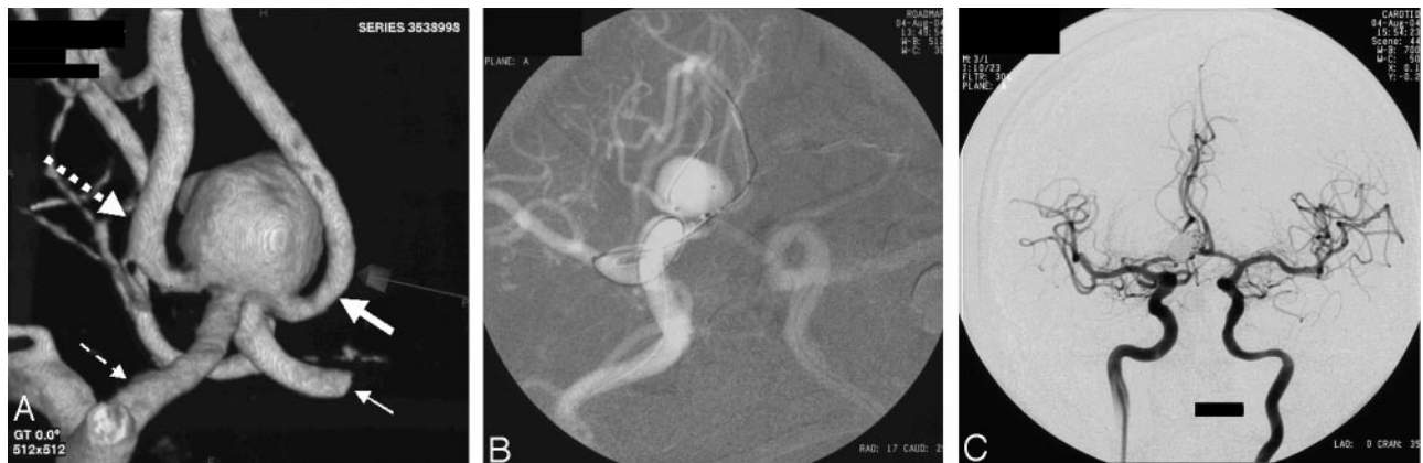
FIG 2. Case 2.

C, Left internal carotid arteriogram after embolization of the anterior communicating artery aneurysm shows satisfactory obliteration of both aneurysms.