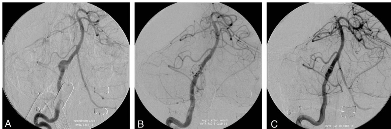
Fig 3. Angiograms in a 52-year-old man (patient 11) with dissecting aneurysm of the distal intracranial right vertebral artery treated with stent-assisted coiling.

A, The stent was placed across the aneurysm neck.