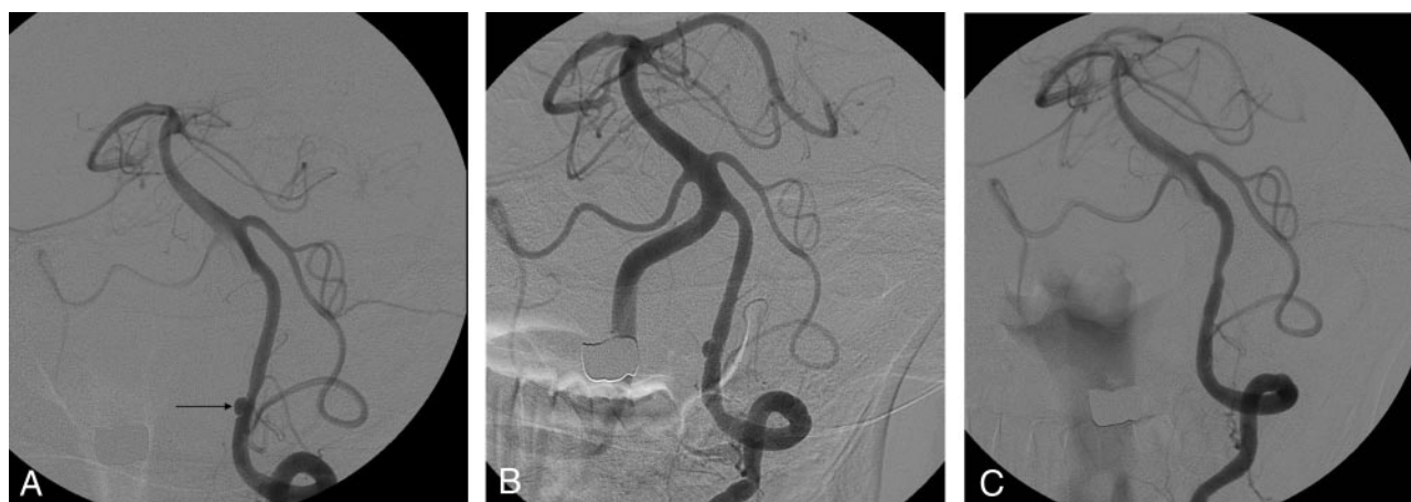
Fig 2. Angiograms in a 37-year-old man (patient 5) with dissecting aneurysm of the distal intracranial left vertebral artery treated with double stent method.

D , Angiogram obtained 19 months after stent deployment reveals no occlusion of the aneurysm.