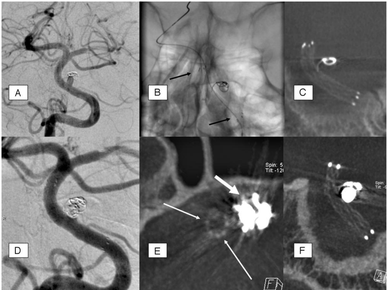
Fig 1. A, The basilar stem aneurysm showed complete occlusion initially after insertion of a single coil 2.5 mm in diameter; coil compaction and significant aneurysm growth in 6-month follow-up-DSA. B, Unsubtracted DSA image after insertion of a Neuroform stent (4 × 20 mm) shows the proximal and distal radiopaque markers of the stent (arrows); the stent itself is not visible. C, MIP reconstruction of ACT performed after stent deployment and before second coil embolization: excellent stent visibility and regular, complete stent deployment. The initially inserted single coil shows compaction and is distant to the parent (basilar) artery and to the stent struts as well, including one coil loop with position adjacent to stent wall, with definite extraluminal position. D, DSA. A total of 4 platinum microcoils (diameters, 2.5 and 2.0 mm, respectively) were additionally inserted. The basilar stem aneurysm shows satisfiable occlusion with minimal dog-ear remnant. E, Axial, thin (1 mm section thickness) MPR reconstruction of ACT performed after stent deployment and second coil embolization (same dataset as in F). This reconstruction allows definite exclusion of stent strut movement or coil protrusion: stent (thin arrows) without deformation adjacent to coil package (thick arrow), which causes some beam-hardening artifacts. F, MIP reconstruction (oblique coronal) of ACT performed after stent deployment and second coil embolization: excellent stent visibility without significant limitation by marginal beam-hardening artifacts through coil package; no change of stent configuration compared with the ACT imaging before the second coil embolization.

cranial hemorrhage in all of the cases confirmed by early MR imaging within 3 days after intervention.