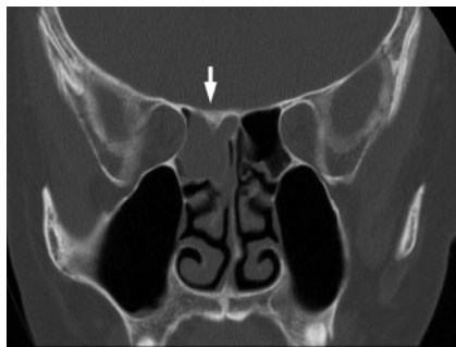
Fig 3. Coronal CT image in a patient with inverted papilloma shows localized cone-shaped hyperostosis of the superior wall of the posterior ethmoid sinus (white arrow). Intraoperative endoscopic examination confirmed that the origin of tumor was located at the superior wall of the right posterior ethmoid sinus.

C, Axial CT image of another patient shows cone-shaped hyperostosis (arrow) involving the anterior wall of the left maxillary sinus, which was proved to be the origin of inverted papilloma by intraoperative endoscopy.