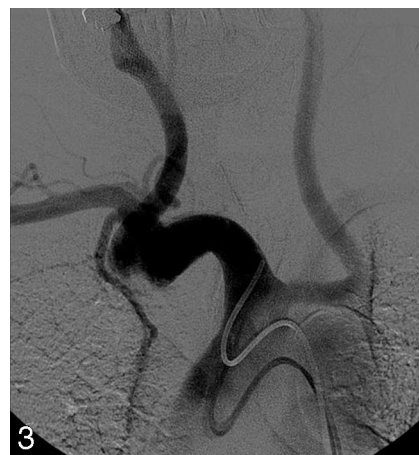
Fig 3. So-called bovine aortic arch.