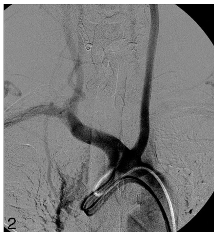
Fig 2. So-called bovine aortic arch.