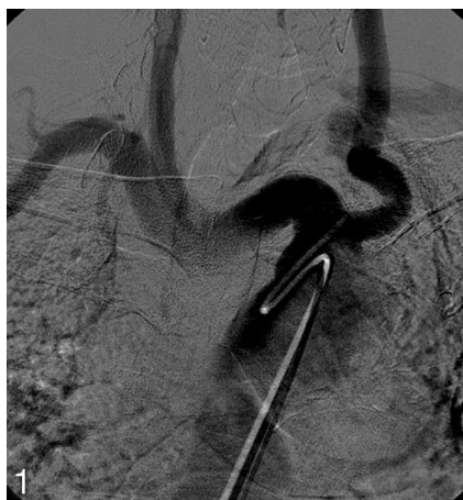
Fig 1. So-called bovine aortic arch.

To reinforce this idea, we illustrate the case of a 44-year-old woman with a multicystic SFT in the right lateral ventricle who presented with right retro-orbital pain and seizure. This multiloculated mass was hypointense on T1-weighted images, hyperintense on T2-weighted images, and demonstrated thin peripheral enhancement of multiple confluent cysts after gadolinium administration (Fig 1A). Histopathologic examination showed spindle cells, and immunohistochemistry was strongly positive for CD34, confirming the diagnosis of SFT (Fig 1B). The case described by Surendrababu et al 1 and ours both emphasize the fact that intracranial SFT is an emerging entity