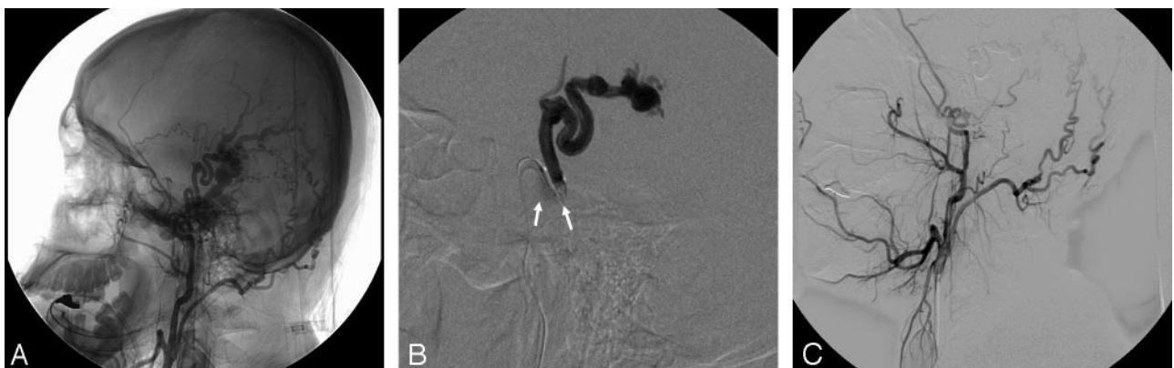
Fig 2. Patient 6.

The embolization procedures were well tolerated by all of the patients without evidence of a systemic or local toxicity, including cranial nerve palsy. Subcutaneous extravasation was noted in 1 patient. Except for mild pain that was controlled