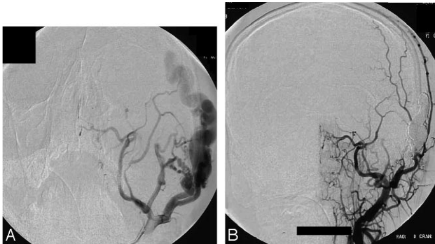
Fig 3. Patient 8.

A , Anteroposterior projection of a left external carotid arteriogram in Waters projection depicts a fistulous CHVM supplied by the superficial temporal, anterior deep temporal, and middle meningeal arteries.