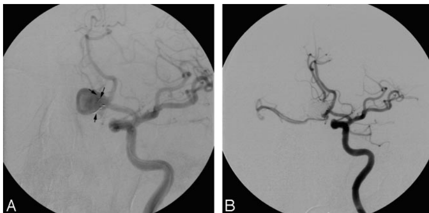
Fig 3. A, Patient 14: left carotid DSA shows the asymmetric placement of the 3 TriSpan nitinol loops (arrows) at the neck of the aneurysm. B, Left carotid DSA shows complete occlusion of the aneurysm.

accumulating coil loops may provide safe packing (Fig 3B). Moreover, the device allowed slight correction of the coil position by changing its degree of deployment and/or by slightly moving the microcatheter. Such maneuvers were only safe at the initial stage of the coiling. Moreover, it required a very stable position of the carrying microcatheter, which was checked carefully before coil deployment. Gradually, we realized that the restrictions imposed by the company sizing chart are relative. 10 In 5 of 16 procedures, the TriSpan had to be smaller than what was recommended by the manufacturer's sizing table to optimize the position and minimize protrusion. It seemed that only the absolute height of the dome determined whether a TriSpan could be deployed. Even when the neck width was larger than the height of the sac (H/n ratio smaller or equal to 1 in patients 8 and 12), a TriSpan coil could still be securely placed when the maximal height (not perpendicular to neck) to neck ratio was >1 ("adjusted" H/n 1.8 and 1.2 in patients 8 and 12, respectively).