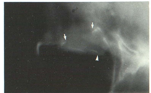
Fig. 2.—Lateral tomogram. Example of measurements. Distance from arrow to arrow constitutes maximum sagittal diameter of floor fracture. Maximum floor depression measured from posterior arrow to arrowhead. All measurements are corrected for magnification.

Similarly, positive diagnosis of a medial wall fracture on plain films required visualization of actual bone displacement, which had to be confirmed on anteroposterior tomograms. Again, the presumptive criteria (unilateral ethmoid clouding and orbital emphysema) alone were not used.