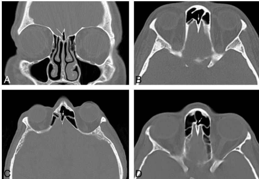
Fig 1. A, Coronal CT scan of the paranasal sinuses in a 45-year-old woman with difficulty breathing shows the typical appearance of crista galli pneumatization (arrow). B, Axial CT scan of the paranasal sinuses in a 51-year-old man with sinus pain shows extensive pneumatization of the crista galli from the right frontal sinus (arrow). C, Axial CT scan of the paranasal sinuses in a 63-year-old man with difficulty breathing shows extensive pneumatization of the crista galli from the left frontal sinus (arrow). D, Axial CT scan of the paranasal sinuses in a 33-year-old woman with difficulty breathing shows minimal pneumatization of the anterior crista galli from the left frontal sinus (arrow).