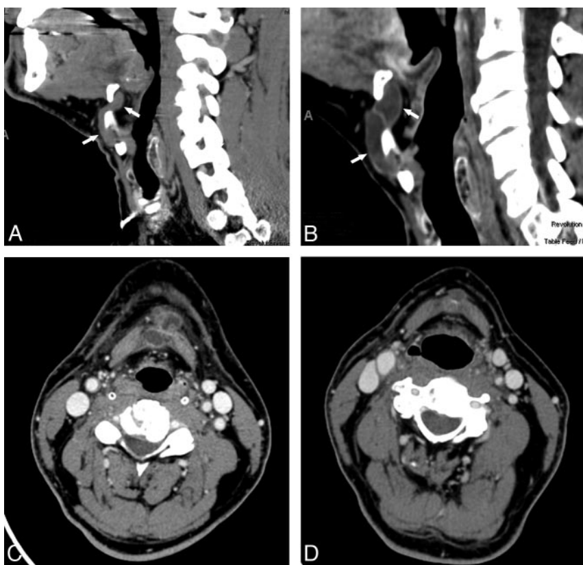
Fig 2. A 54-year-old man before and after IMRT for treatment of a T2N2B base of tongue squamous cell carcinoma. A , Sagittal reconstructed image of a contrast-enhanced CT series before RT showing an isodense structure coursing from a location posterior to the hyoid, anteroinferiorly through the thyrohyoid membrane, and finally into a position anterior to the thyroid cartilage ( arrows ). B , Sagittal reconstructed image obtained 30 days after the completion of RT. The lesion is clearly larger and more cystlike ( arrows ). C , Axial, contrast-enhanced CT image obtained 7 months after the image in 2 B , during an asymptomatic period. The cyst appeared more complex and irregular, with suspected inflammatory changes peripherally and in the nearby platysma muscles. Infection was suggested. Results of an ultrasound-guided biopsy revealed a benign cyst. It was finally hypothesized that self-massage for the purpose of improving lymphatic drainage and alleviating edema caused irritation of the cyst and the adjacent soft tissues. D , Axial, contrast-enhanced CT image obtained 90 weeks after RT. Inflammatory changes had long since resolved, and the cyst is both smaller and less conspicuous, as was generally the case with our series of cases.

tory changes, and a diagnosis of TGDC infection was posited (Fig 2). Although the patient was asymptomatic and was without clinical signs of infection, the finding of cyst enlargement was concerning to the referring clinician. A sonography-guided biopsy was performed; microscopic analysis revealed proteinaceous fluid and histiocytes, and a diagnosis of a benign cyst was made. It was considered possible in this case that