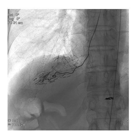
Fig 1. A 58-year-old man with postsurgical recurrence of hepatocellular carcinoma. Selective right internal angiogram, obtained during the injection of Lipiodol and polyvinyl alcohol mixture, shows opacification of pulmonary artery branches in the right lower lung zone.

A history of prior hepatic resection, postsurgical TAE, and spinal metastasis all represent an advanced stage of HCC, and these 3 conditions can potentially coexist in a candidate for vertebroplasty. Therefore, we propose that noncontrast CT should be performed before vertebroplasty of such a patient for screening of Lipiodol embolism.