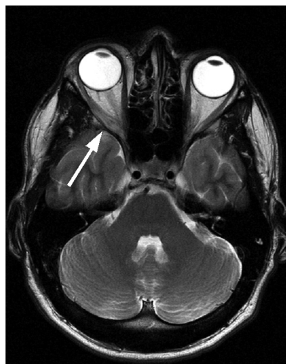
Fig 1. Cerebral MR image shows swelling of the right lateral rectus muscle (arrow) on a T2-weighted image. Note the position of the bulbi indicating right-sided weakness for abduction.

During the stay, he reported having had similar symptoms at the contralateral (left) eye 18 months previously, with diplopia on looking to the left. According to the patient and the medical records, pain and other signs of inflammation had been absent. At that time, abducens nerve palsy had been diagnosed. Brain MR imaging and intra-