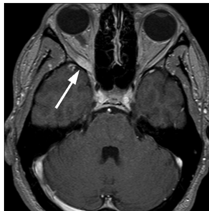
Fig 2. Cerebral MR image shows swelling of the right lateral rectus muscle (arrow) on a T1-weighted image with contrast enhancement. Note the position of the bulbi, indicating right-sided weakness for abduction.

Received April 5, 2009; accepted after revision May 17.