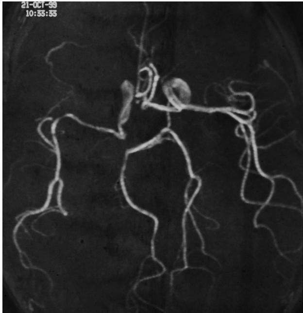
Fig 2. MR angiography of the patient at 2 years old shows a hypoplastic right siphon and middle cerebral artery, with a stenotic Sylvian bifurcation.