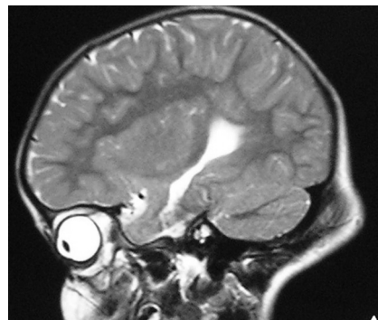
Fig 1. Sagittal T2-weighted MR image reveals a normal left cerebellar hemisphere. The visualized supratentorial parenchyma appears normal.

The purpose of this case report was to present an unusual cerebellar malformation, which we believe has not been reported so far.