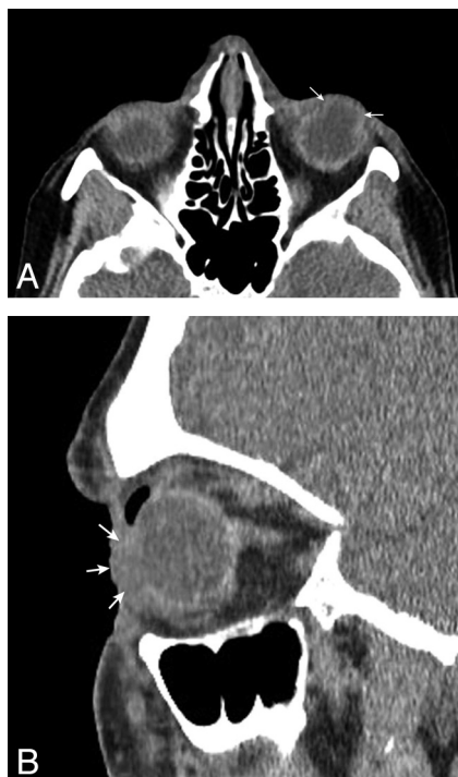
Fig 2. Axial (A) and sagittal (B) CT scans in patient 2 show a grossly enlarged anterior chamber (arrows). No lens is seen. This patient had a posttraumatic corneal melt.