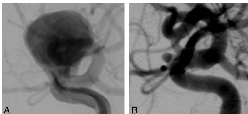
FIG 2. Examples of the major discrepancy among 5 readers. Saccular aneurysm of the left cavernous ICA before (A) and after (B) the procedure. After exclusion of the large aneurysm, another small aneurysm was detected on the anterior genu of the ICA.

Our study had some limitations. As noted, this study was mostly restricted to aneurysms of the paraclinoid ICA, which may have limited the generalizability of our findings. There was clustering of outcomes, with most of the cases demonstrating complete occlusion, which may have lowered the statistical value. 21,22 The definition of “near-complete” or “incomplete” occlusion should be considered specifically in PED embolization because the healing mechanism of the PED is different than that of the coil, and this terminology might create confusion with clinicians regarding decisions for subsequent treatment vs observation. Moreover, in cases of multiple aneurysms, it is necessary to clarify