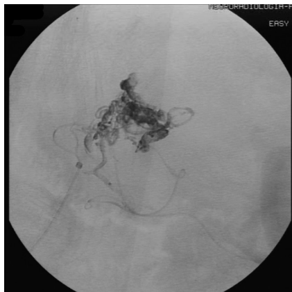
FIG 4. Case 4. Onyx cast at the end of the procedure (DSA unsubtracted image, lateral view).

of hemorrhage. The venous access was performed from the femoral vein and intracranially through the straight sinus in 4/5 cases; the nidus was reached through basal vein of Rosenthal in 3 cases (cases 2, 4, and 5) and in 1 case from the superior choroidal vein (case 1). In the other case, the superior petrous sinus was used for the venous access and the nidus was reached through the vein of the great horizontal fissure of the cerebellum (case 3).