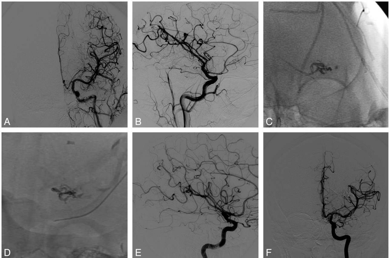
FIG 2. Case 1. Final angiograms at the end of the procedure in anteroposterior (AP; A ) and lateral ( B ) views. Onyx cast at the end of the procedure (DSA unsubtracted images) in AP ( C ) and lateral ( D ) views. Six-month DSA follow-up in AP ( E ) and lateral ( F ) projections confirming the complete and persistent occlusion of the AVM.

because his clinical condition was unchanged at discharge and after the 6-month clinical follow-up (mRS score, 5).